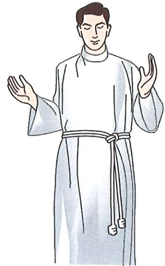
Knot is on left hip