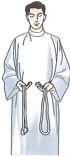
Wrap around waist with knots on your right side