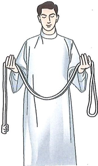
Fold cincture in half