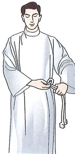
Drop loop and then tighten around waist