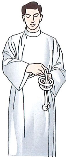
Slip knotted ends through loop (where left hand is making sure that single loop is on top of double cincture.) Feed knotted ends through loop from top to bottom