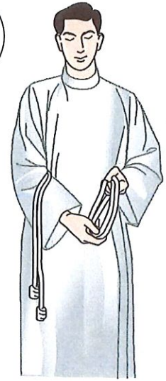
Using right hand, slip loop over left hand, keeping hold of cincture