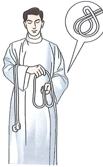
Grab end of loop made by the fold and overlap as shown