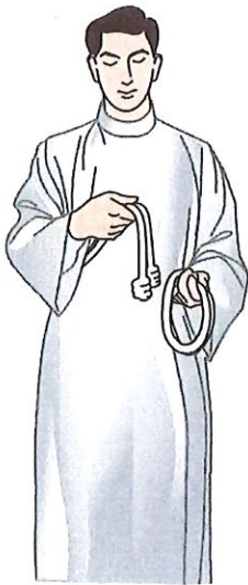
Grab knotted end with your right hand